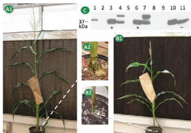
Figure 5. Requirement for a chimeric chloroplast transit peptide-DMO enzyme in transgenic maize to obtain high-level tolerance to dicamba treatment. Transgenic Hi II maize containing the 35S-ZmCTP-DMO gene (A1, A2) and transgenic Hi II maize containing the 35S-DMO gene lacking a chloroplast transit peptide coding region (B1, B2) were simultaneously treated postemergence at 15 days after planting with 20 kg/ha dicamba (A1, A2) or 6.7 kg/ha (B1, B2), respectively. Plants were photographed 75 days after planting to illustrate morphological and size differences (paper bag length = 40 cm) (A1, B1) and differences on prop root development (A2, B2). (C) Detection of DMO expression in transgenic and nontransgenic maize plants using protein blots incubated with anti-DMO antibodies. Lanes: 1, native DMO produced in E. Coli ; 2 and 5, protein extracts of transgenic Hi II maize not expressing DMO; 3 and 6, protein extracts of the transgenic Hi II maize shown in A1 and A2 expressing DMO from the 35S-ZmCTP-DMO gene (+ = plus CTP); 4 and 7, protein extracts of the transgenic Hi II maize expressing DMO from the 35S-AtCTP-DMO gene; 8, protein extracts of nontransgenic parental Hi II; 9, protein extracts of nontransgenic parental H99; 10, protein extracts from a transgenic Hi II maize transformant expressing DMO from the 35S-ZmCTP-DMO gene; 11, protein extracts from a transgenic Hi II maize transformant expressing DMO from the 35S-DMO gene lacking a CTP coding region (– = minus CTP). 37 kDa = migration of size marker.

traits into individual crop varieties (e.g., cotton varieties triply stacked with glyphosate, glufosinate, and dicamba tolerance genes). This will allow the use of herbicide mixtures (e.g., dicamba and glyphosate) and herbicide rotations to control present herbicide-resistant weeds, control the spread of these weeds, and slow the evolution of new types of herbicide-resistant weeds. Such an approach will be a powerful aid to farmers in maintaining the economic payoffs, ease of production practices, and environmental advantages they have come to depend on from the availability of herbicide-tolerant crops.