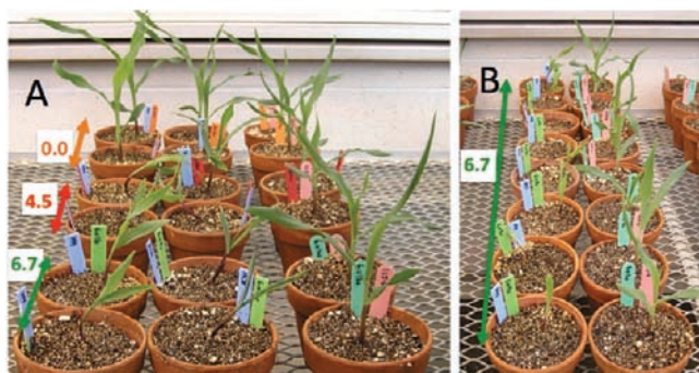
Figure 2. Comparison of damage due to treatment of transgenic and nontransgenic maize plants with dicamba applied pre-emergence: (A) herbicide symptoms of nontransgenic H 99 (left file), nontransgenic Hi II (middle file), and transgenic Hi II containing the 35S-ZmCTP-DMO gene (right file) sprayed with dicamba at 0 kg/ha (back two rows), 4.5 kg/ha (middle two rows), and 6.7 kg/ha (front two rows); (B) comparison of growth of nontransgenic Hi II plants (left file) and transgenic Hi II plants containing the 35S-ZmCTP-DMO gene both treated with dicamba at 6.7 kg/ha. Plants are pictured at 15 days after planting.